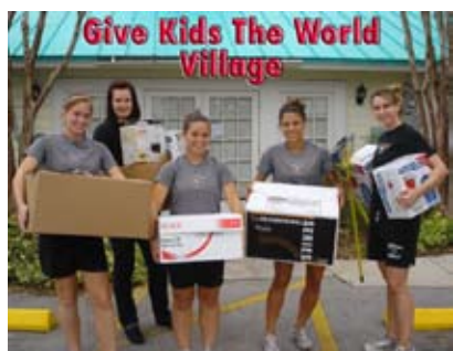
Give Kids The World Village

The Barry University Student-Athlete Advisory Committee (SAAC) had a busy 2007-08 year. They started out doing a team building activity at a local ropes course for the