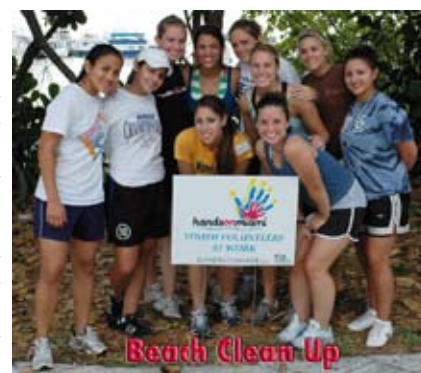
Beach Clean Up

In addition, student-athletes from volleyball and women's soccer traveled to Orlando to join other Sunshine State Conference institutions in a conference wide community service project at the Give Kids the World Village in Kissimmee, Florida.