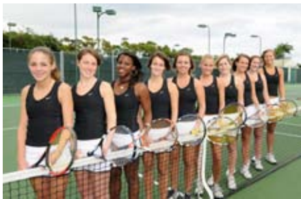
Women's Tennis – 2008 Spring Term GPA 3.669

Eighty-four student-athletes made the president's list (4.0), dean's list (3.5 to 3.99) or athletic director's list (3.2 to 3.49).