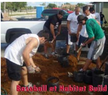
Baseball at Habitat Build

Foundation fundraising. Many ideas were brought up but the one that we capitalized on was selling the Make-A-Wish "stars" during lunch and at home athletic contests. Over 800 stars were sold and hung in the lobby of the Health & Sports Center throughout the year. The Barry SAAC raised $11,450 for the Make-A-Wish Foundation through team donations, star sales, spare change drives, concession sales, silent auctions and a talent show.