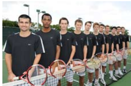
Men's Tennis – 2008 Spring Term GPA 3.236