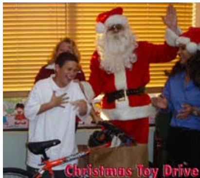
Christmas Toy Drive

In the fall semester, student-athletes donated over 300 toys and delivered them to the Just Kids Centers in Miami before Christmas along with 15 bicycles which were donated by