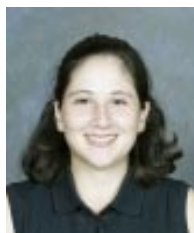
Meredith Kane Golf Management