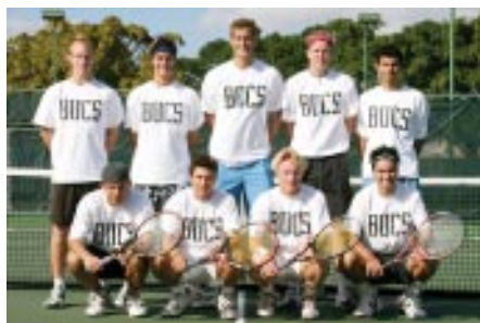
Men's Tennis - 2003 Fall Term GPA 3.455