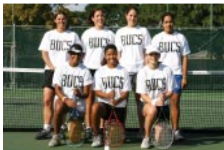
Women's Tennis - 2003 Fall Term GPA 3.664

In addition, 33 student-athletes made the dean's list and 37 were named to the athletic director's list. (See page 5 for full list) The fall sports athletes were also named to the Sunshine State Conference Commissioner's Honor Roll. (see page 2 for full list)