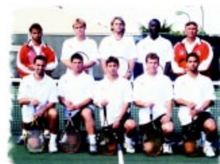
Men's Tennis - Fall 2.815 Term GPA