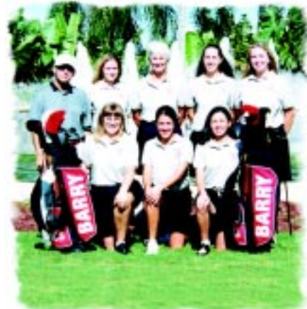
Women's Golf Highest Team GPA Fall (3.577) and Spring (3.510)

In the spring, the women's golf team also posted the women's highest team GPA at 3.510, while the men's golf team had the highest men's team GPA at 3.045.