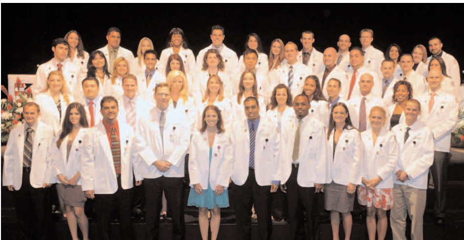
Barry University School of Podiatric Medicine, Class of 2010