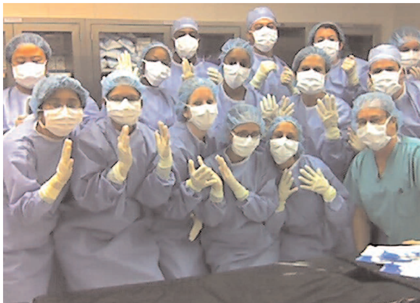
PA Gowning Session, Class of 2009 learn how to maintain a safe and sterile environment for the surgical patient in OR

Who's on the Cover: Faculty and staff of the School of Podiatric Medicine and Physician Assistant program stand proudly in front of the new Center for Community Health and Minority Medicine.