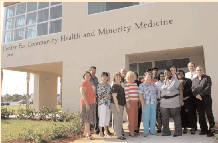
School of Podiatric Medicine and Physician Assistant Program faculty and staff at the new Center for Community Health and Minority Medicine

Faculty and staff from Barry University's School of Podiatric Medicine and the Physician Assistant Program began moving into the Center for Community Health and Minority Medicine on Monday, July 14. The move into the new facility, located at 320 NW 115th Street in Miami, is expected to continue throughout the summer.