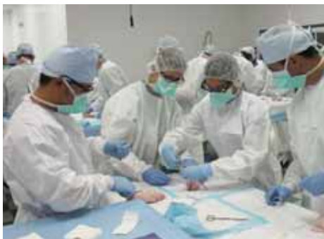
Class of 2013 students from the School of Podiatric Medicine practice suturing on pigs' feet at Stryker South Florida Learning Center