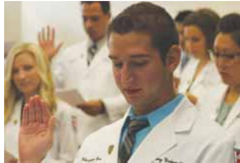
Miami Shores campus

On August 26, 2011, 93 physician assistant students from the Physician Assistant Program Class of 2013 took part in a live, historic interactive White Coat Ceremony, held concurrently on three campuses: the Barry University Miami Shores campus, the University Partnership Center at St. Petersburg College, and the new U.S. Virgin Islands campus at the Governor Juan F. Luis Hospital and Medical Center. The new campus in the U.S. Virgin Islands was made possible through two grants totaling nearly $1.5 million to the Barry PA program from the U.S. Department of Health and Human Services, Office of Health Resources and Services Administration.