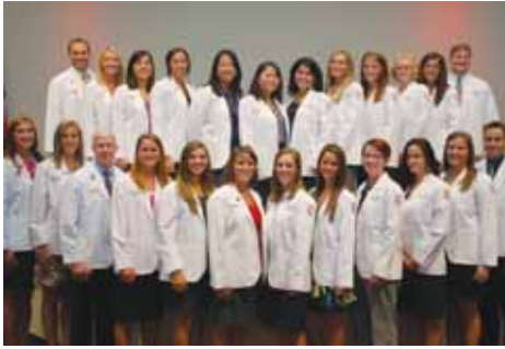
St. Petersburg campus