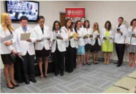
Inaugural class, PA USVI campus