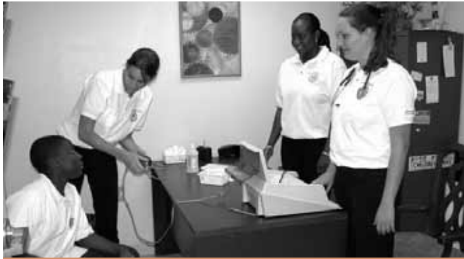
Undergraduate nursing students perform health screening at PCNC school.