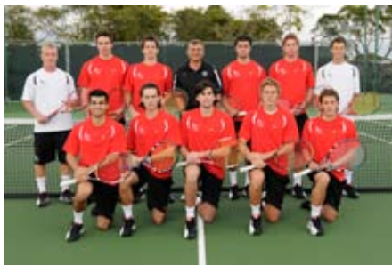
Men's Tennis – 2009 Spring Term GPA 3.272