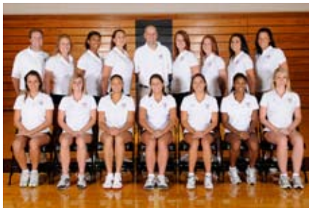
Volleyball – 2009 Spring Term GPA 3.570