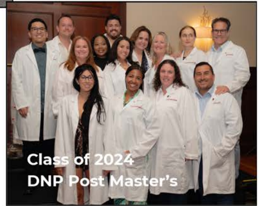
Class of 2024 DNP Post Master's

It has been some time since we celebrated with you all, but it's never too late to do so! Let's take a trip down memory lane and reflect on your incredible accomplishments, hard work and dedication that brought you to this moment.