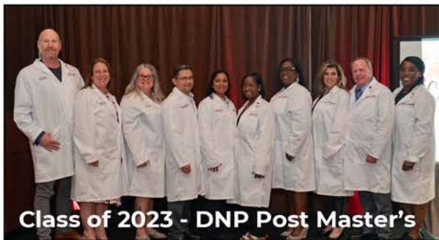
Class of 2023 - DNP Post Master's

Congratulations to the Barry University Nurse Anesthesia Class of 2023 and 2024 on this incredible achievement! Whether completing the Post- Baccalaureate or Post-Master's program, your hard work, perseverance, and dedication have led you to this well-earned milestone. We celebrate your success and the impact you will make in anesthesia. Wishing you all the best—this is just the beginning!