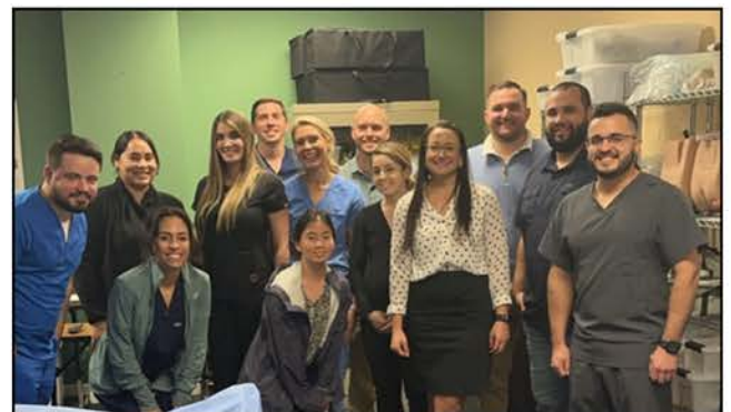
West Palm Beach Classroom

We are proud to welcome the South Florida Class of 2026 to our new campus at the University Center in Hollywood! This state-of-the-art facility represents our commitment to excellence in anesthesia education, providing students with an innovative and supportive learning environment. We are excited for this new chapter and look forward to all the achievements to come.