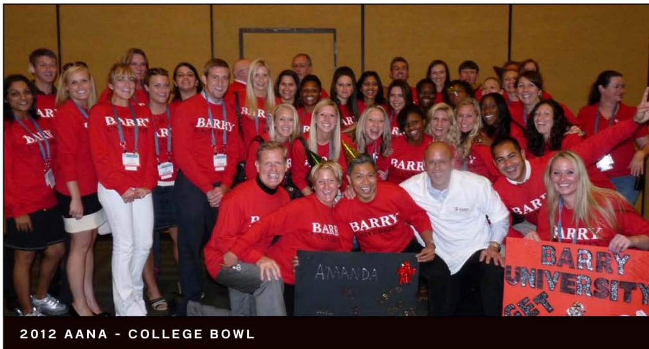
2012 AANA - COLLEGE BOWL