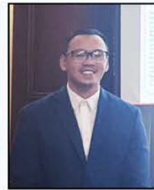
RRNA Hoang Lang