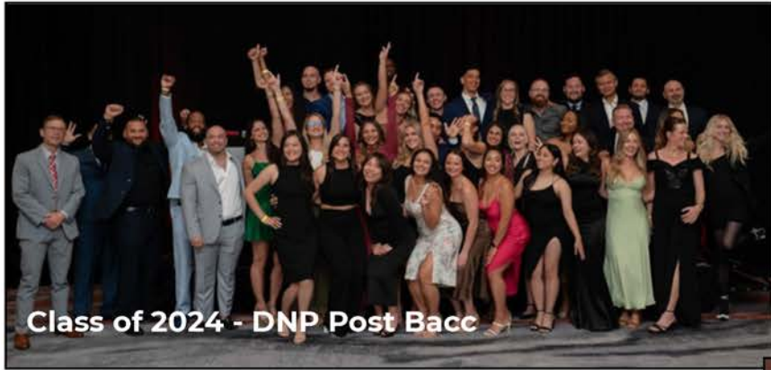
Class of 2024 - DNP Post Bacc