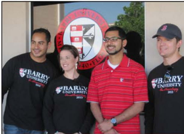
ORLANDO C/O 2023 IN FRONT OF ORLANDO CLASSROOM SITE

With this move, students will continue to benefit from easy access to clinical experiences while enjoying a modern and spacious classroom setting. We look forward to this exciting transition and the opportunities it brings for our program and students!