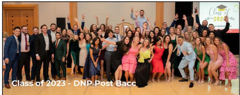
Class of 2023 - DNP Post Bacc

We want you to know how much we miss you! We hope you are all thriving in your careers and making a lasting impact as CRNAs. No matter where life takes you, Barry will always be home!